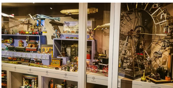
Swiss Children's Museum (Zurich)

Explore Les Enfants du Monde Museum, dedicated to children's rights and global childhood experiences.