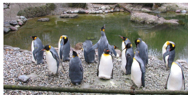
Zurich Zoological Garden (Zurich)

Experience the Swiss Children's Museum, a place that celebrates children's creativity and encourages understanding of their rights.