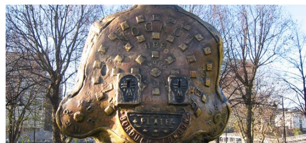
Les Enfants du Monde Museum (Paris)

Visit Maison de la Photographie, an institution that promotes artistic expression and protection of children's rights through visual storytelling.