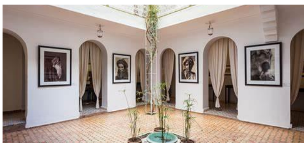
Maison de la Photographie (Paris)

Visit Maison de la Photographie, an institution that promotes artistic expression and protection of children's rights through visual storytelling.