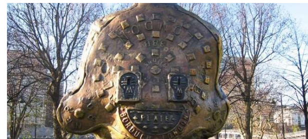
Les Enfants du Monde Museum (Paris)

Visit Maison de la Photographie, an institution that promotes artistic expression and protection of children's rights through visual storytelling.