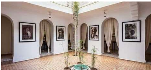
Maison de la Photographie (Paris)

Visit Maison de la Photographie, an institution that promotes artistic expression and protection of children's rights through visual storytelling.