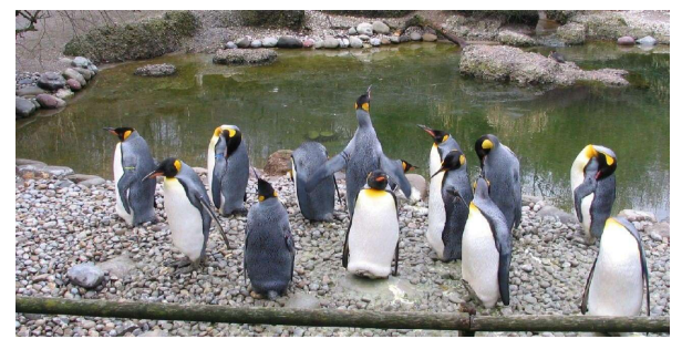
Zurich Zoological Garden (Zurich)

Experience the Swiss Children's Museum, a place that celebrates children's creativity and encourages understanding of their rights.