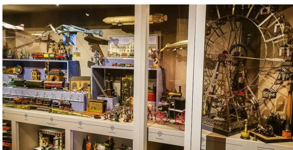
Swiss Children's Museum (Zurich)

Explore Les Enfants du Monde Museum, dedicated to children's rights and global childhood experiences.