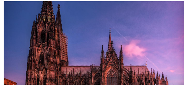
Cologne Cathedral (Cologne)

Explore Vasamuseet, a symbol of Sweden's maritime history. It provides valuable lessons in urban sustainability and water systems, making it an ideal destination for your training journey.