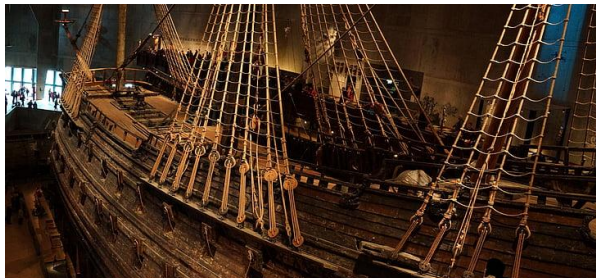
Vasa Museum (Stockholm)

Explore Vasamuseet, a symbol of Sweden's maritime history. It provides valuable lessons in urban sustainability and water systems, making it an ideal destination for your training journey.