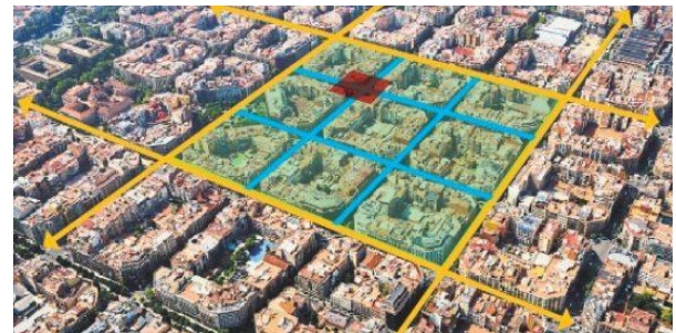
Poble Nou Superblock (Barcelona)

Explore Park Güell, designed by the renowned architect Antoni Gaudí. The park showcases Barcelona's approach to creating urban green spaces and artistic cityscapes.