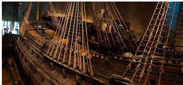
Vasa Museum (Stockholm)

Explore Vasamuseet, a symbol of Sweden's maritime history. It provides valuable lessons in urban sustainability and water systems, making it an ideal destination for your training journey.