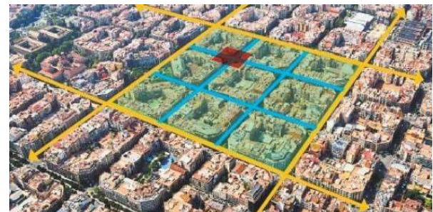
Poblenou Superblock (Barcelona)

Explore Park Güell, designed by the renowned architect Antoni Gaudí. The park showcases Barcelona's approach to creating urban green spaces and artistic cityscapes.