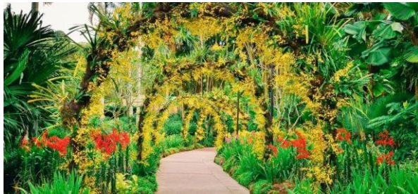
Singapore Botanic Gardens (Singapore)

Explore Singapore's commitment to green spaces and urban forestry at the iconic Singapore Botanic Gardens. Witness how urban greenery is integrated into smart city planning.