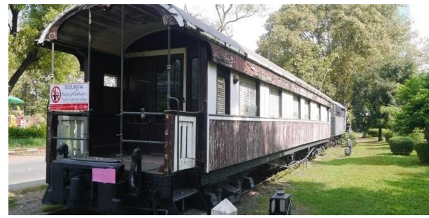
Suan Rot Fai (Railway Park, Bangkok)

Kuala Lumpur Tower provides a panoramic view of the city, highlighting how urban forestry plays a role in Malaysia's smart city development and green initiatives.