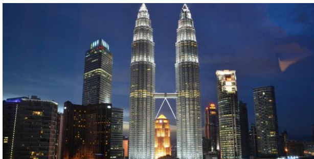
Kuala Lumpur Tower (Kuala Lumpur)

FRIM offers insights into Malaysia's sustainable forestry practices. Participants will discover how community involvement contributes to the preservation and management of forests.