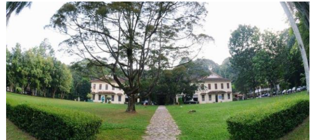
Forest Research Institute Malaysia (Kuala Lumpur)

Explore Singapore's commitment to green spaces and urban forestry at the iconic Singapore Botanic Gardens. Witness how urban greenery is integrated into smart city planning.