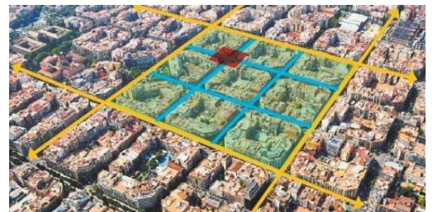
Poblenou Superblock (Barcelona)

Explore Park Güell, designed by the renowned architect Antoni Gaudí. The park showcases Barcelona's approach to creating urban green spaces and artistic cityscapes.