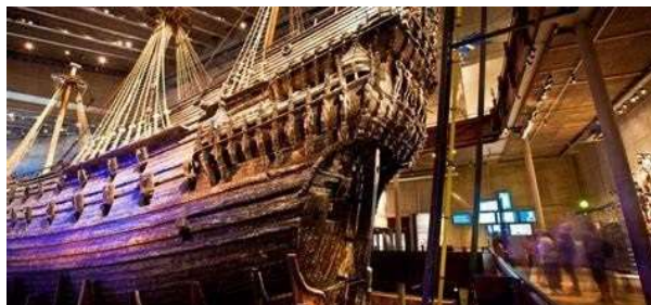
Vasa Museum (Stockholm)

Step into the Vasa Museum and explore Sweden's maritime history, a testament to the country's sustainable approach to shipbuilding and water-based transport.