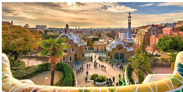
Park Güell (Barcelona)

Explore Les Enfants du Monde Museum, dedicated to children's rights and global childhood experiences.