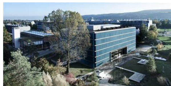
Swiss Federal Institute of Aquatic Science and Technology (Zurich)

Stroll along the shores of Lake Zurich, a prime example of sustainable water resource management in a vibrant city.