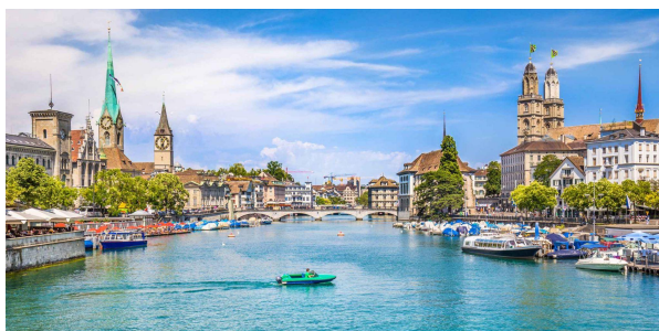
Lake Zurich (Zurich)

Explore this renowned museum, located in the heart of Paris, to understand the city's commitment to environmental sustainability through art and culture.