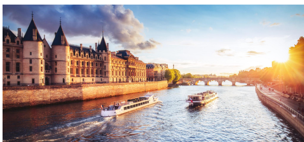
Seine River Promenade (Paris)

Cruise along the Seine River to witness how urban planning and river preservation coexist in harmony, providing a unique perspective on integrated basin management.