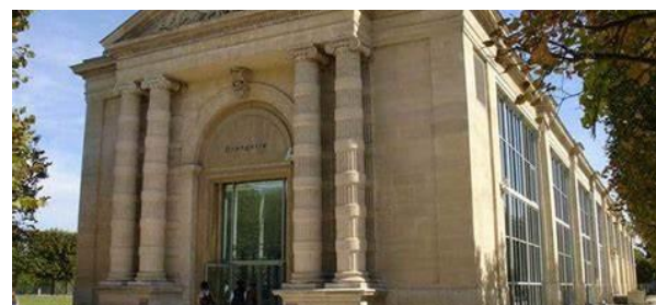
Musée de l'Orangerie (Paris)

Cruise along the Seine River to witness how urban planning and river preservation coexist in harmony, providing a unique perspective on integrated basin management.