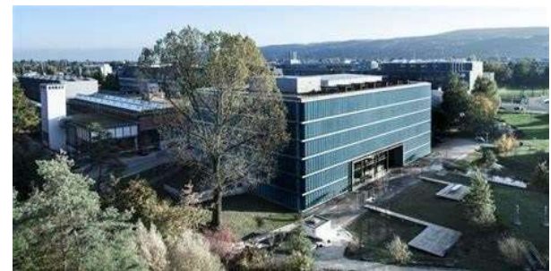
Swiss Federal Institute of Aquatic Science and Technology (Zurich)

Stroll along the shores of Lake Zurich, a prime example of sustainable water resource management in a vibrant city.