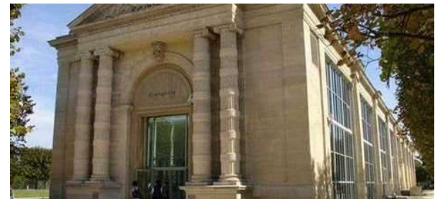
Musée de l'Orangerie (Paris)

Cruise along the Seine River to witness how urban planning and river preservation coexist in harmony, providing a unique perspective on integrated basin management.