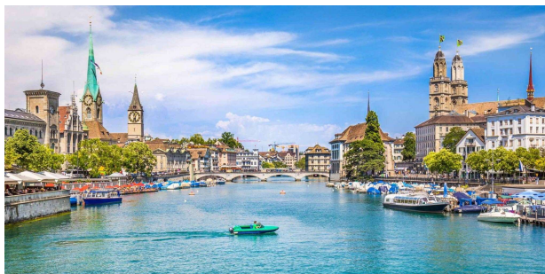
Lake Zurich (Zurich)

Explore this renowned museum, located in the heart of Paris, to understand the city's commitment to environmental sustainability through art and culture.