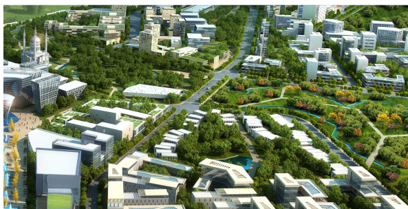
Kazan Smart City Technologies Center (Kazan)

Explore Gazprom Neft's technology centre, a leader in the development of smart energy and infrastructure solutions.