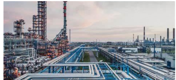
Gazprom Neft Scientific and Technological Center

Explore Skolkovo, Russia's hub of innovation and entrepreneurship, to gain insights into power and infrastructure development projects.