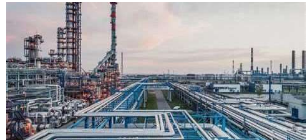
Gazprom Neft Scientific and Technological Center

Explore Skolkovo, Russia's hub of innovation and entrepreneurship, to gain insights into power and infrastructure development projects.