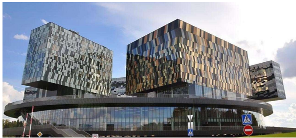
Skolkovo Innovation Center (Moscow)

Explore Skolkovo, Russia's hub of innovation and entrepreneurship, to gain insights into power and infrastructure development projects.