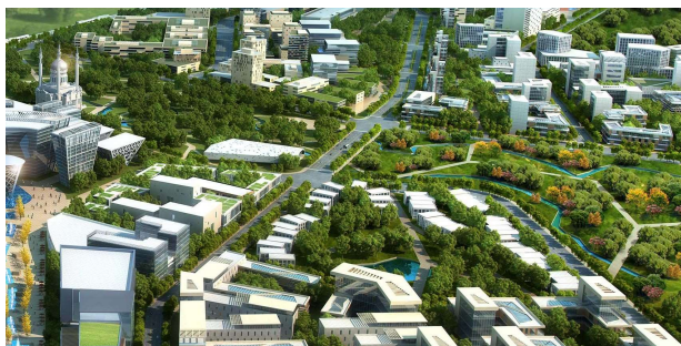
Kazan Smart City Technologies Center (Kazan)

Explore Gazprom Neft's technology centre, a leader in the development of smart energy and infrastructure solutions.