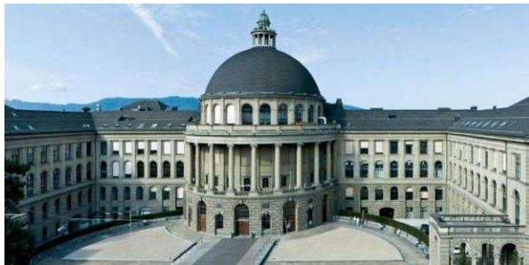
Swiss Federal Institute of Technology (ETH Zurich)

La Défense, Paris's business district, reflects leadership in modern urban planning and development, showcasing France's expertise in contemporary business administration.