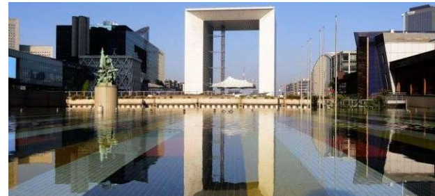
La Défense (Paris)

The Louvre Museum embodies leadership in art and culture preservation, offering inspiration on the importance of visionary leaders in heritage conservation.