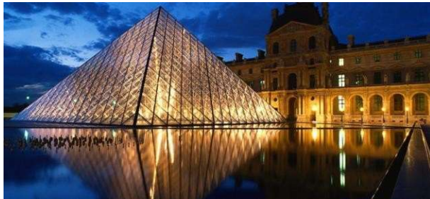
Louvre Museum (Paris)

The Louvre Museum embodies leadership in art and culture preservation, offering inspiration on the importance of visionary leaders in heritage conservation.