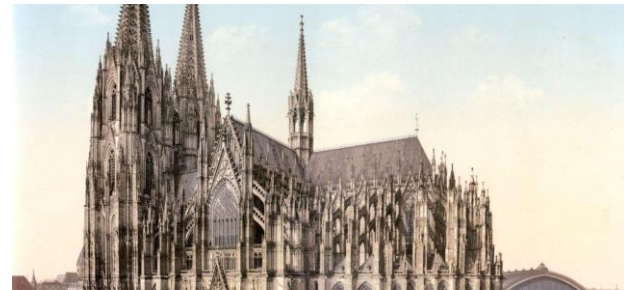
Cologne Cathedral (Cologne)

The Vasa Museum showcases leadership in maritime preservation, offering insights into the importance of visionary leaders in heritage conservation.