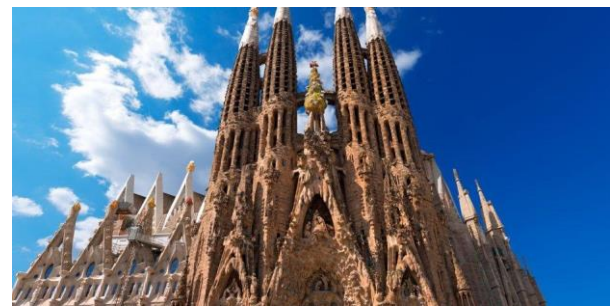
Sagrada Família (Barcelona)

The Chocolate Museum illustrates leadership in niche industries, emphasising innovation and successful brand management.