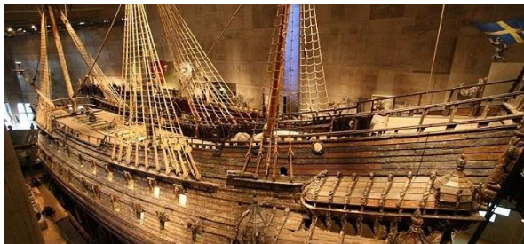
Vasa Museum (Sweden)

The Vasa Museum showcases leadership in maritime preservation, offering insights into the importance of visionary leaders in heritage conservation.