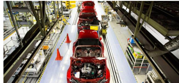
Mazda Factory Tour (Hiroshima)

The Edo-Tokyo Museum delves into Japan's historical transformation and resilience, underlining the role of leadership in cultural preservation and advancement.