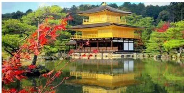
Kinkaku-ji (The Golden Pavilion, Kyoto)

The Mazda Factory Tour offers insights into Japan's automotive leadership and manufacturing excellence, showcasing efficient leadership in production.