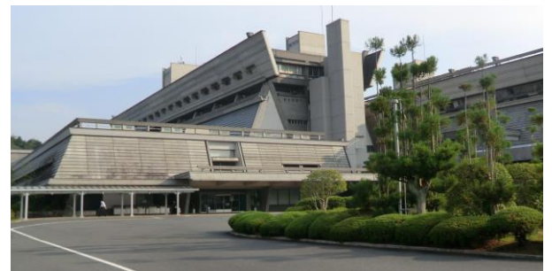
Kyoto International Conference Center (Kyoto)

Kinkaku-ji's breathtaking beauty underscores Japan's leadership in cultural preservation, highlighting the importance of heritage in modern society.