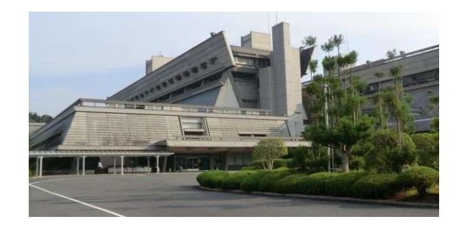
Kyoto International Conference Center (Kyoto)

Kinkaku-ji's breathtaking beauty underscores Japan's leadership in cultural preservation, highlighting the importance of heritage in modern society.