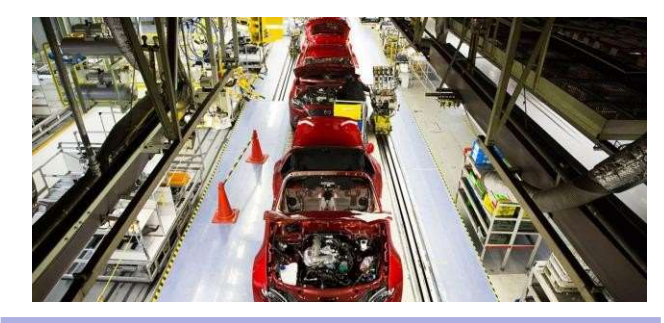
Mazda Factory Tour (Hiroshima)

The Edo-Tokyo Museum delves into Japan's historical transformation and resilience, underlining the role of leadership in cultural preservation and advancement.