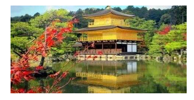
Kinkaku-ji (The Golden Pavilion, Kyoto)

The Mazda Factory Tour offers insights into Japan's automotive leadership and manufacturing excellence, showcasing efficient leadership in production.