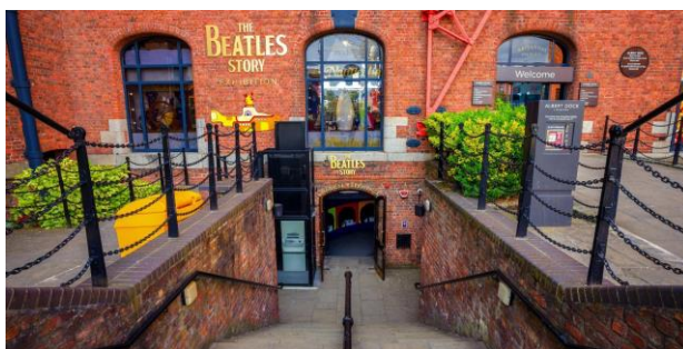
The Beatles Story museum (Liverpool)

Is a lush green oasis within a bustling city, illustrating the importance of leadership in urban green spaces and sustainable city management.