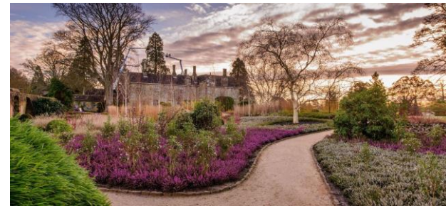
The Winter Garden (Sheffield)

The British Museum houses a treasure trove of human history, emphasising leadership's role in preserving and showcasing global heritage.