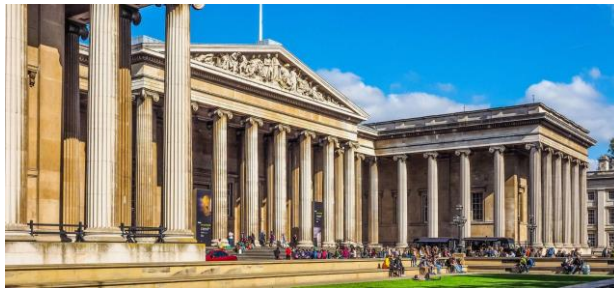
The British Museum (London)

The British Museum houses a treasure trove of human history, emphasising leadership's role in preserving and showcasing global heritage.