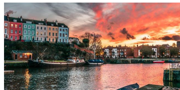
Bristol Harbour (Bristol)

The Beatles Story museum exemplifies leadership in the music industry and creative business administration, highlighting the role of visionaries in entertainment.