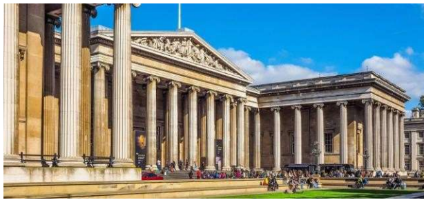
The British Museum (London)

The British Museum houses a treasure trove of human history, emphasising leadership's role in preserving and showcasing global heritage.