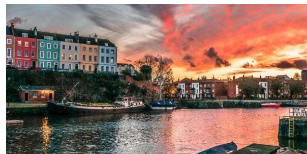
Bristol Harbour (Bristol)

The Beatles Story museum exemplifies leadership in the music industry and creative business administration, highlighting the role of visionaries in entertainment.