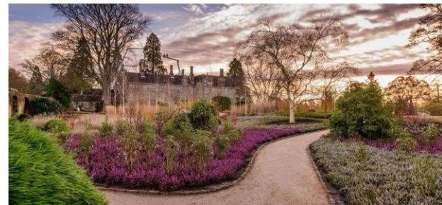
The Winter Garden (Sheffield)

The British Museum houses a treasure trove of human history, emphasising leadership's role in preserving and showcasing global heritage.