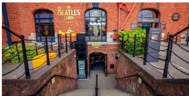
The Beatles Story museum (Liverpool)

Is a lush green oasis within a bustling city, illustrating the importance of leadership in urban green spaces and sustainable city management.