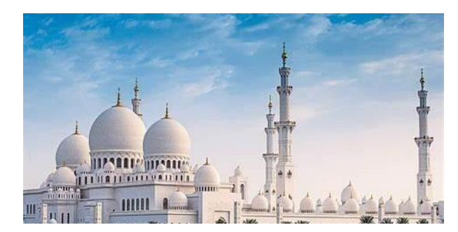
Sheikh Zayed Grand Mosque (Abu Dhabi)

Shining example of sustainable urban design, highlighting energy-efficient infrastructure and smart city technologies.