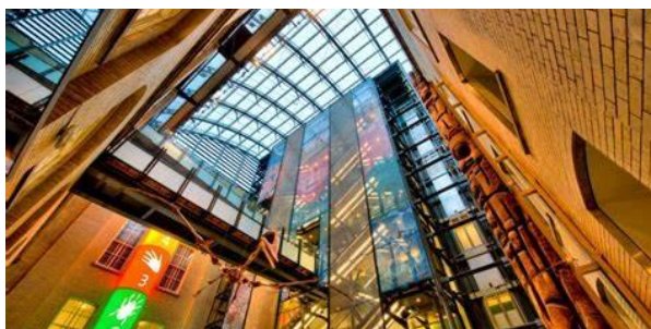
World Museum Liverpool (Liverpool)

Discover the Sheffield Winter Garden, one of the largest urban glasshouses in Europe. Learn about urban agriculture and sustainable city planning through the city's green oasis.