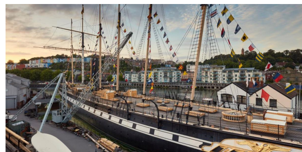
Brunel's SS Great Britain (Bristol)

Explore the World Museum Liverpool to understand the importance of sustainable fisheries and animal husbandry in history and modern society.