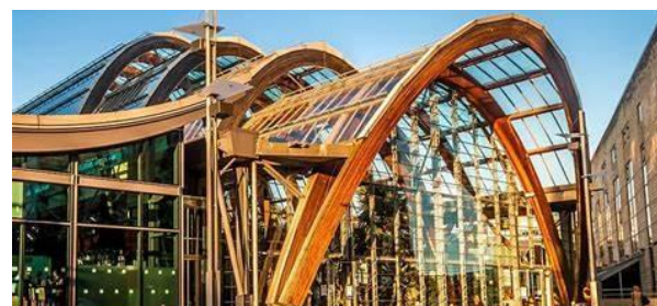
Sheffield Winter Garden (Sheffield)

Visit the Royal Botanic Gardens, Kew, a UNESCO World Heritage site. Explore how horticulture, botany, and agricultural research contribute to urban green spaces and sustainability.