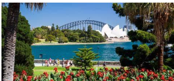
Royal Botanic Gardens, Kew (London)

Visit the Royal Botanic Gardens, Kew, a UNESCO World Heritage site. Explore how horticulture, botany, and agricultural research contribute to urban green spaces and sustainability.