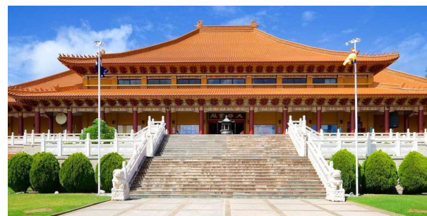
Nan Tien Temple (Wollongong)

Explore the Melbourne Sports and Aquatic Centre, highlighting the importance of fitness and recreation in a smart city, promoting a healthier lifestyle.