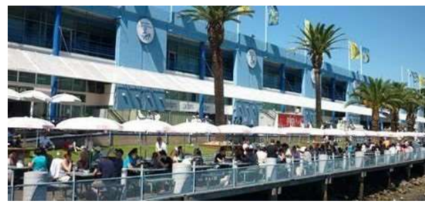
Sydney Fish Market (Sydney)

Explore the Royal Botanic Garden, a lush oasis in the heart of Sydney, showcasing urban greenery and sustainable landscaping for healthier city living.