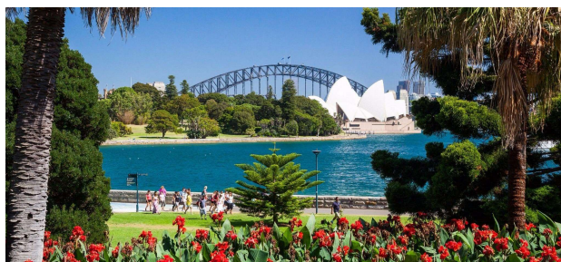
Royal Botanic Garden (Sydney)

Explore the Royal Botanic Garden, a lush oasis in the heart of Sydney, showcasing urban greenery and sustainable landscaping for healthier city living.