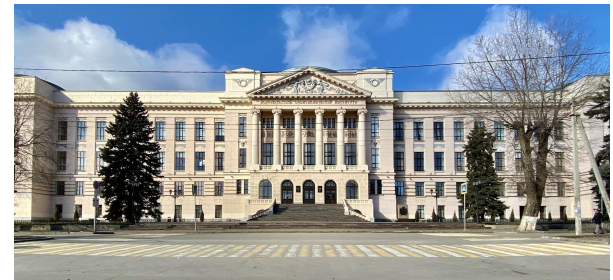
St. Petersburg Polytechnic University

Explore the Moscow Smart City Lab, a hub for technological innovation and smart urban planning. Discover how Moscow is leading the way in smart city development.