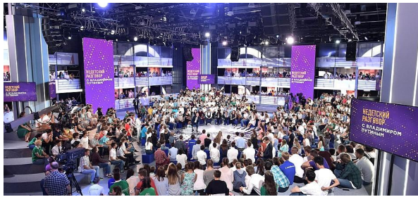
Moscow Smart City Lab (Moscow)

Explore the Moscow Smart City Lab, a hub for technological innovation and smart urban planning. Discover how Moscow is leading the way in smart city development.