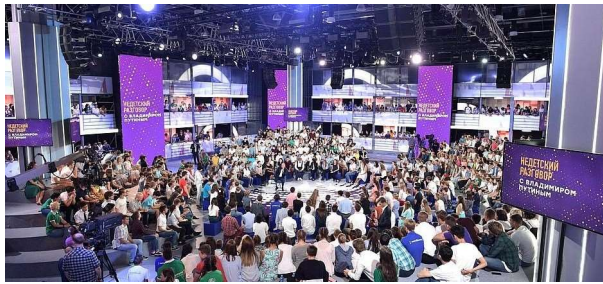
Moscow Smart City Lab (Moscow)

Explore the Moscow Smart City Lab, a hub for technological innovation and smart urban planning. Discover how Moscow is leading the way in smart city development.