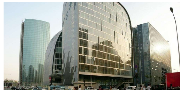
Kazan Smart City Technologies Center

Discover Innopolis University, known for its excellence in smart metering and energy systems. Engage with experts driving innovation in Kazan.