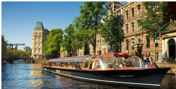
Amsterdam Canal Cruise (Amsterdam)

Visit Zurich's state-of-the-art water treatment plant to witness Switzerland's expertise in ensuring high-quality drinking water. Understand the critical role of water quality in sustainable city development.