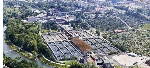
Zurich Water Treatment Plant (Zurich)

Symbol of scientific progress, represents Belgium's innovation and technological prowess. It emphasises the intersection of science, sustainability, and urban development.